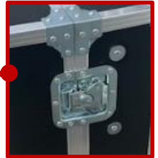
2 x Tough & Durable Keylocks