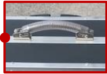
Strong Carry Handle