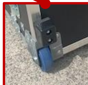
2 x Heavy Duty Wheels